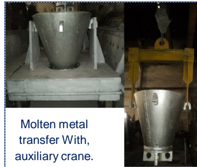
Molten metal transfer With, auxiliary crane.